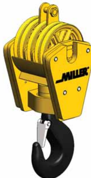
MODEL NO: 520H80 -5 SHEAVES, 20" DIAMETER -CHEEK WEIGHTS -80 TON WLL