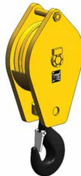
MODEL NO: 224T50 -2 SHEAVES, 24" DIAMETER -EXTENDED SIDE PLATES -50 TON WLL