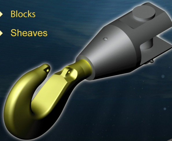
PLET Anchoring Hook Assembly 300 metric tons working load